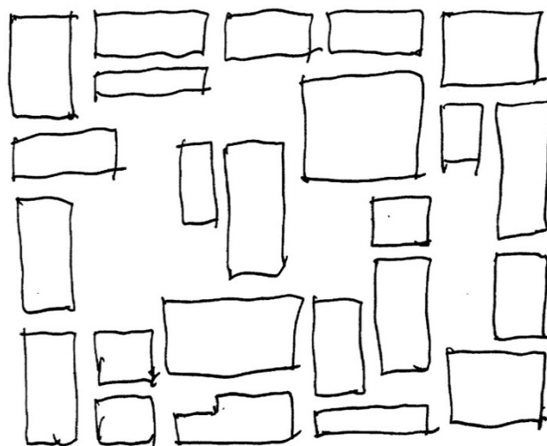
Figure 3. Acceptable plan, despite the formal rectangular grid, includes a connected distribution of urban spaces in a sequence of different sizes.

Community-built dwellings turn out individually different and are uniquely adapted for their location—a variety that the top-down building industry is incapable of producing economically (Figure 3). A Faustian bargain is reached whenever the industrial-modernist approach and typologies replace the spontaneous city. In accepting them, the builder or user trade away adaptivity to the human scale for a crude and mechanical conception of the world. Proposals arising from such an industrial mind-set are hardly ever adapted to the land. The special complexity of life’s processes and ecological interaction is seen to detract from the “maximally efficient” model and is therefore not allowed to influence how the land is shaped.