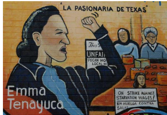
31 Figure 7. A mural on the Westside of Emma Tenayuca.

Tenayuca and a group of Mexican women broke down stereotypes of race and gender when they decided to walk out of their jobs as pecan shellers. The legal segregation that resulted from city reports by the HOLC left minorities in the Westside in appalling conditions. Lack of running water and toilets outside of the main living area are few examples of the conditions Latinos lived in. The strike sought to bring attention to the poverty wages, but did not stop there. They also shed light on the misery public assistance the New Deal had “promised,” the refusal to hire Mexicans in skilled jobs, and the atrocious living conditions on the West Side. 32 In his book, Blue Texas , Max Krochmal describes the set stage the strike provided as it made its way to a more democratic institution. Krockmal details the social effects that the Westside was plagued