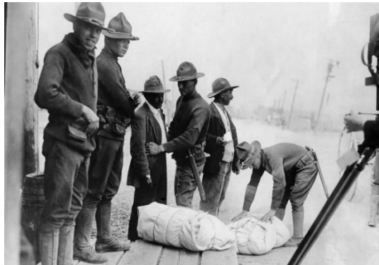
9 Figure 1. Mexican migrants being inspected at the U.S.- Mexico Border.

Three immigrant waves resulted at the turn of the twentieth century. The first ran from 1900 to 1909, and it included the loyal Mexican ricos that differed in political ideologies. The second wave of immigration lasted from 1910 to 1919, and it included those seeking peace from political and religious oppression. Lastly, and the one that served the city of San Antonio the most economic benefit ran from 1920 to 1929. This last group included those willing to do the laborious work of the agricultural fields found in San Antonio. Those that found themselves in this southwestern city settled permanently because of the need for unskilled labor. The need for cheap labor was so great that businessmen sent out agents across the border to proclaim the employment opportunities found in San Antonio in order to attract laborers. This worked well as much of the news began to spread by word of mouth.