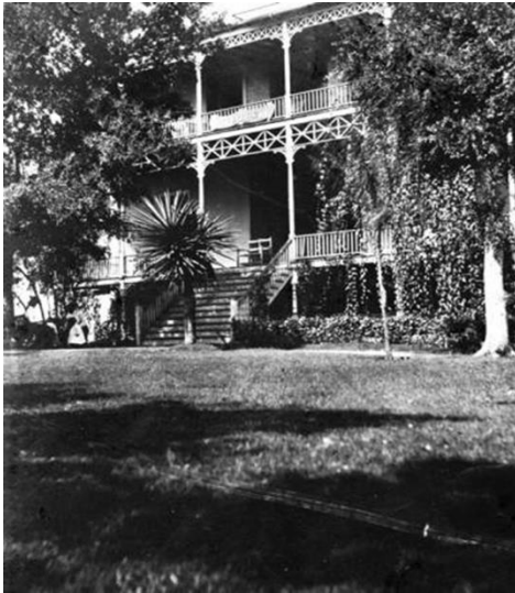
25 Figure 4. Exterior of Argyle Hotel, Alamo Heights.

However, denying Latinos the ability to borrow money meant they never had the opportunity to gain their own wealth due to the legacies of the Federal Housing Administration. The difference economic wealth had in communities is seen in the following photographs. Figure 4 depicts the Argyle Hotel found in Alamo Heights ten years before Figure 5 was taken, which presents the deplorable living conditions found in the corrales on the Westside.