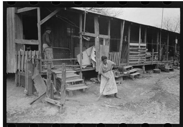
26 Figure 5. A Mexican corral , Westside.

Legislation that passed as part of the New Deal hurt the flourishing of the Latino community. Being politically ostracized led to economic denial and social struggle. Legal segregation led to residential segregation on the Westside, which then showcased the income disparity that prevented equal opportunity from reaching all people of color. Socially, minorities were left to keep their culture secluded to their part of the city. The remainder of the city, predominantly the white men in power that made said decisions, did not want to engage in this “other” culture. They fixated their actions on the lasting theme of nativism. If they had to be in