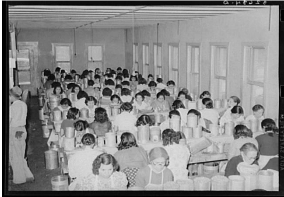
30 Figure 6. Pecan Sheller's at work.

her that he had lost everything because of the economic downturns in the nation. 29 Although she was young when the triggers occurred, it prepared her for the fight she took part in 1938.