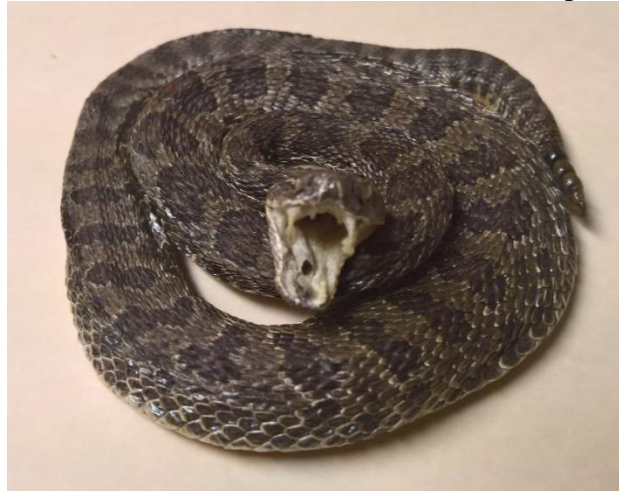
Figure 9: Picture of a Souvenir from the 2019 Sweetwater, Texas Rattlesnake Roundup

The people of Sweetwater are highly defensive when it comes to altering their Roundup in anyway, but they also know that there are organizations trying to shut it down. I attended the 2019 Sweetwater Rattlesnake Roundup. While I was looking at a table full of rattlesnake souvenirs, I overheard a long time Jaycee, Jaycee A 2 (personal communications, 10 March 2019), covered in rattlesnake attire and tending to the merchandise, talking to another retired Jaycee (see Figure 9 for an example of a souvenir from the Rattlesnake Roundup). He explained how the Roundup has changed over the years and how it is not the same because the TPWD have been trying to shut it down.