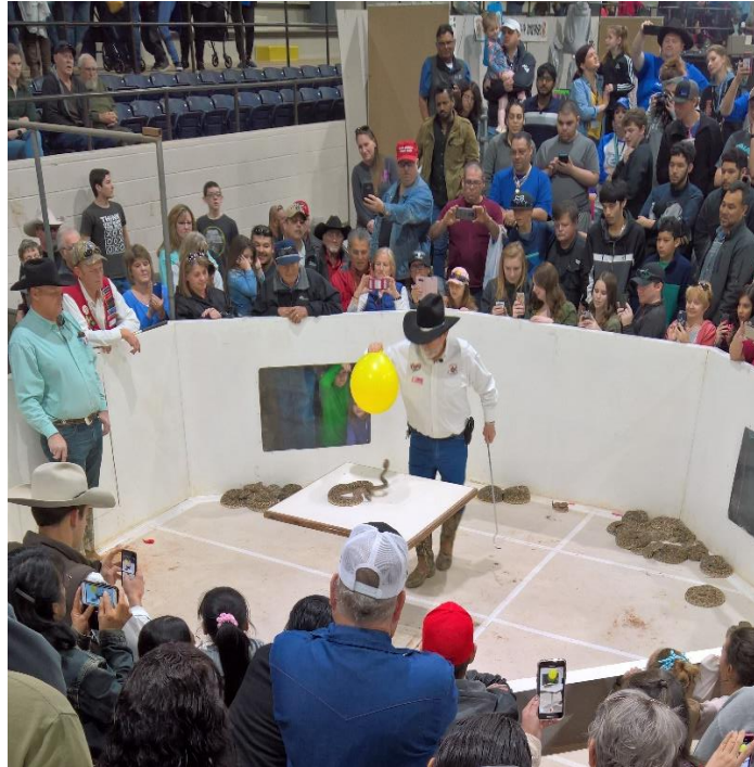
Figure 8: Rattlesnake Being Taunted by Balloon at the 2019 Sweetwater, Texas Rattlesnake Roundup

The limited educational value of the Rattlesnake Roundup is illustrated in Figure 8, where a Jaycee is taunting a snake to thrill the audience.