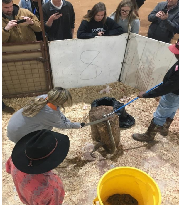
Figure 6: Girl Decapitating a Rattlesnake at the 2019 Sweetwater, Texas Rattlesnake Roundup

At the Roundup, they sell the skins and the meat. Figure 6 shows a snake being decapitated.