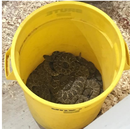
Figure 11: 55-gallon container with Rattlesnakes at the 2019 Sweetwater, Texas Rattlesnake Roundup

The rattlesnakes are caught from areas all the way from the Dallas area to El Paso. If there were a limit to how many each team can capture, then there would be less gassing. The Sweetwater Roundup can still be a family friendly event but with fewer snakes. The Roundup already brings in thousands of pounds, so a few thousand less couldn't make much of a difference. The number of skinned snakes should be limited, and the Roundup organizers should consider displaying more snakes at another Roundup rather than skinning so many. There are other roundups that take place in the state of Texas and some of the Sweetwater snakes could be used for those events. When I attended this event, I stayed for the full day and was able to learn more by talking with some of the Jaycees. At the "Skinning Pit," I asked the Jaycee with the machete how many more snakes remained and what were they going to do with the others snakes that were still alive. Jaycee B 3 (personal communication, 10 March 2019) responded that they had about six more snakes left in the 55-gallon container and that the other snakes that were still alive had been purchased by someone for another roundup that doesn't bring in as many as Sweetwater does (see Figure 11).