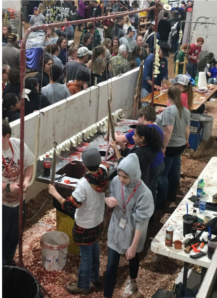
Figure 7: Rattlesnakes Being Skinned at the 2019 Sweetwater, Texas Rattlesnake Roundup

At the “Skinning Pit” the snakes are decapitated with a machete and their heads are put in a small 5 gallon bucket and the snake’s wiggling body is thrown into a 55 gallon container. From there, their bodies are skinned at the next station—see Figure 7.