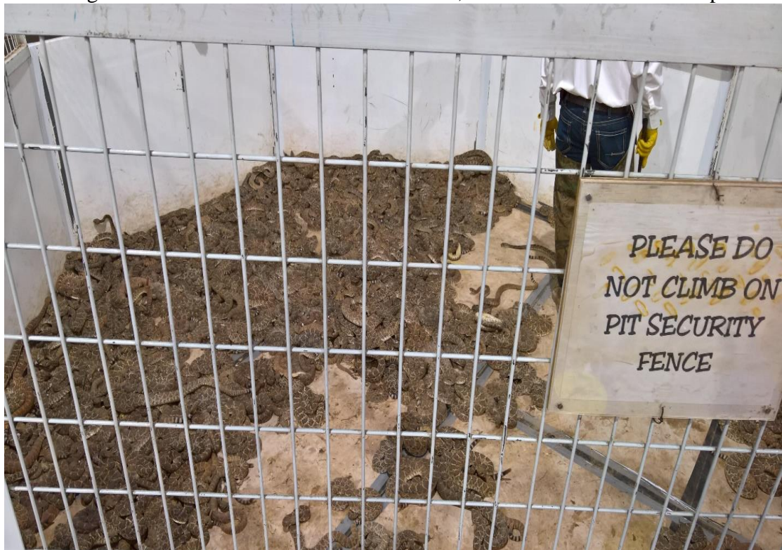
Figure 4: Snake Pit at the 2019 Sweetwater, Texas Rattlesnake Roundup

The roundup in Sweetwater offers prizes for the most pounds of snakes captured and the longest snake captured (see Figure 4).