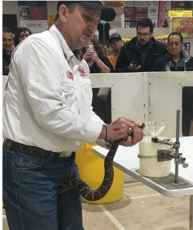
Figure 3: Jaycee Milking Snake for Venom at the 2019 Sweetwater, Texas Rattlesnake Roundup

For instance, the Jaycees milk snakes for venom, which has educational value (see Figure 3).