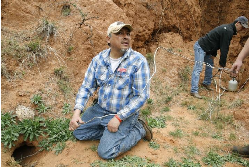
Figure 1: Garden Sprayer Being Used for Gassing a Snake Den

Every year in March, Sweetwater, Texas holds its annual main event: The World's Largest Rattlesnake Roundup. Thousands of western diamondback snakes are killed at this festival for the public to see (MacCormack, 2018, para. 11). The rattlesnake hunters use gasoline to spray in the snakes' dens to flush them out. This is a hunting technique called "gassing" (Scudder, 2018, para. 9). Many of the Sweetwater Jaycees, the hunters, use this method of hunting because gassing is a legal hunting method in Texas (see Figure 1).