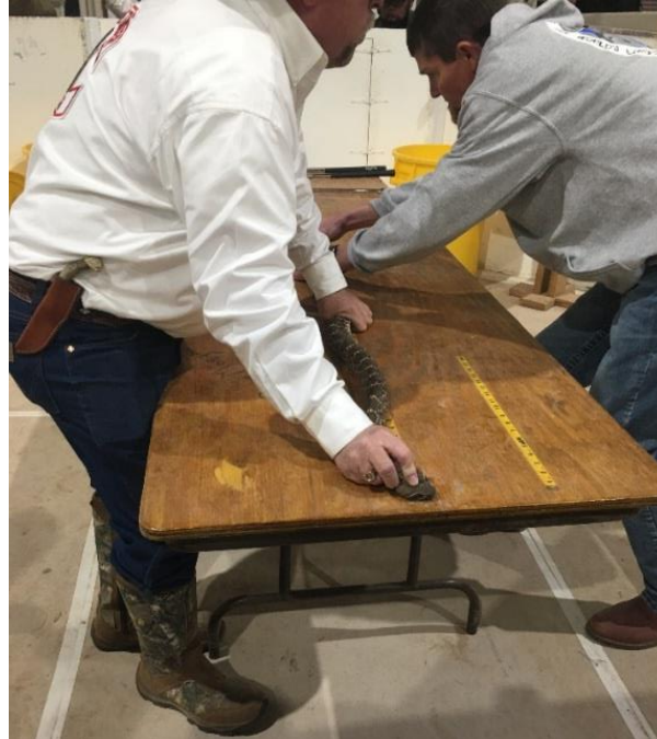
Figure 5: Rattlesnake Being Measured at the 2019 Sweetwater, Texas Rattlesnake Roundup