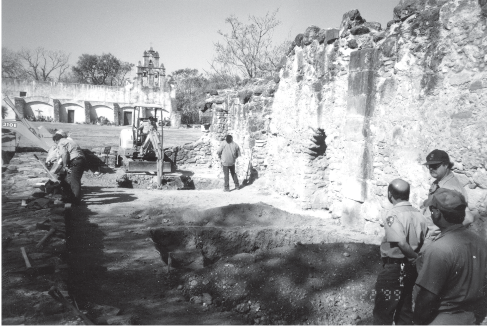
Figure 3. Excavation of reburial areas in progress.