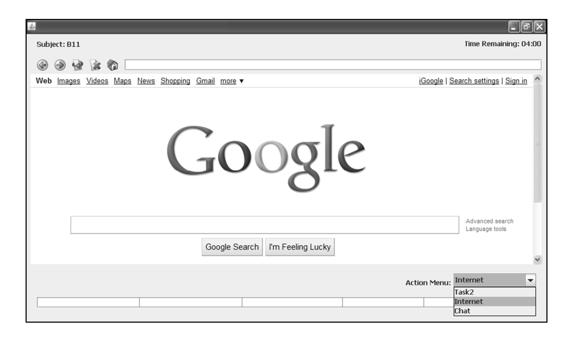
Figure 2. Embedded Internet screen.