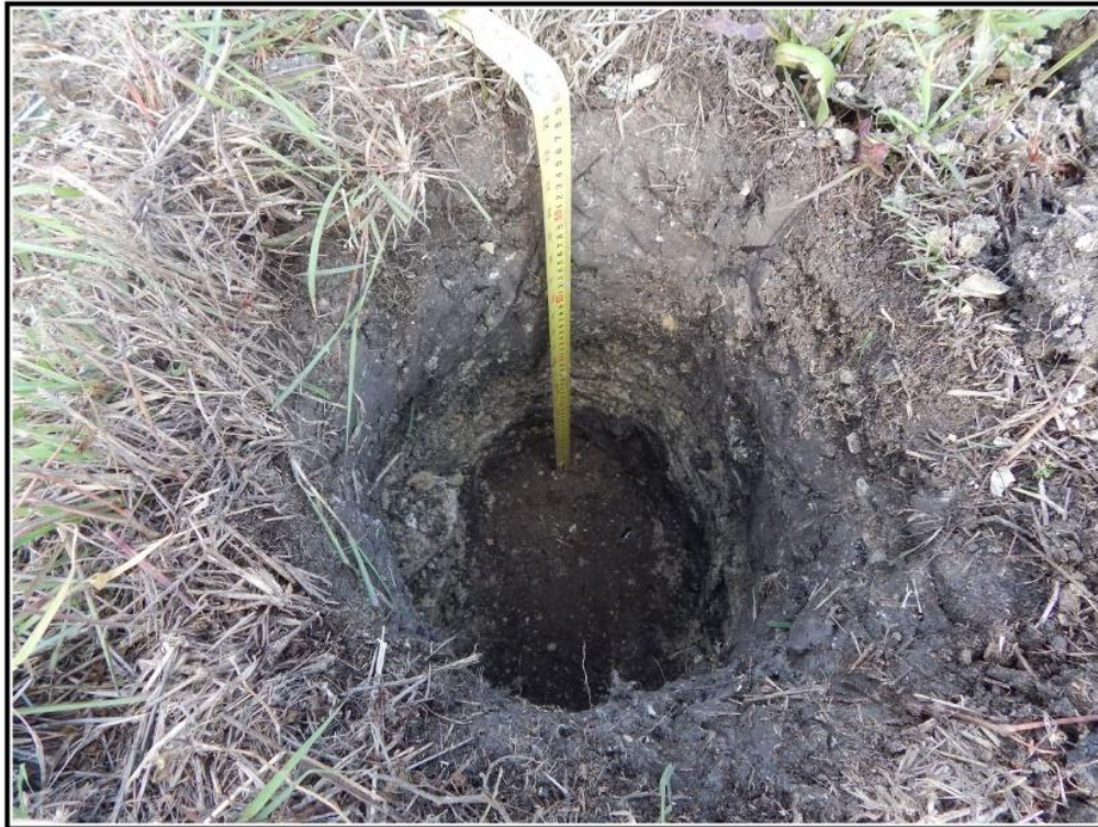
Figure 4-2. Shovel Test 1 (60 cmbs), note trash deposit at bottom.