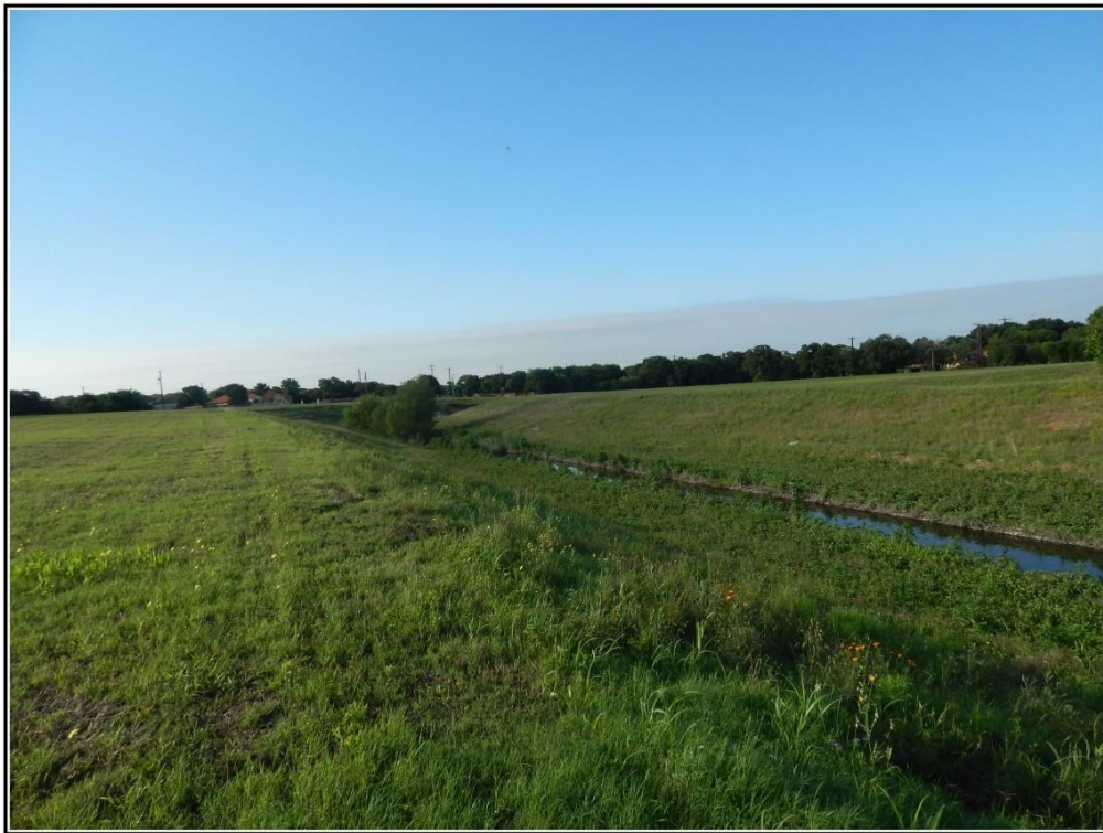
Figure 4-7. Channelized Zarzamora Creek within the project area (facing south).