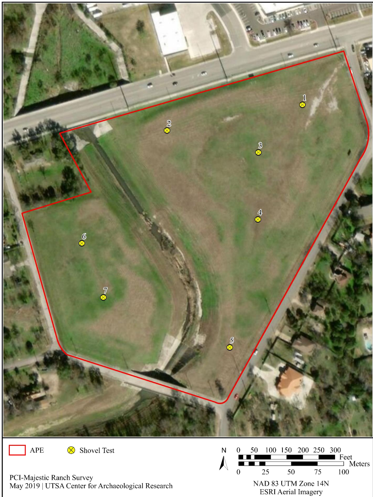
Figure 4-1. Shovel test distribution within the APE.