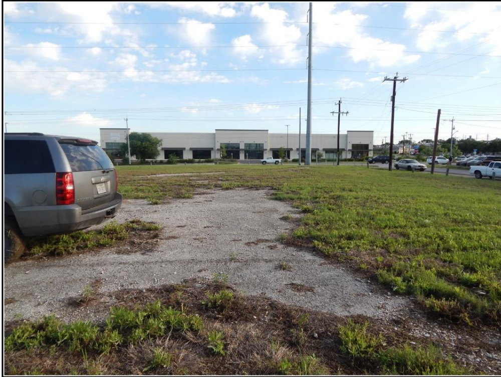
Figure 4-6. Pavement within the project area (facing north, Callaghan Road in the background).