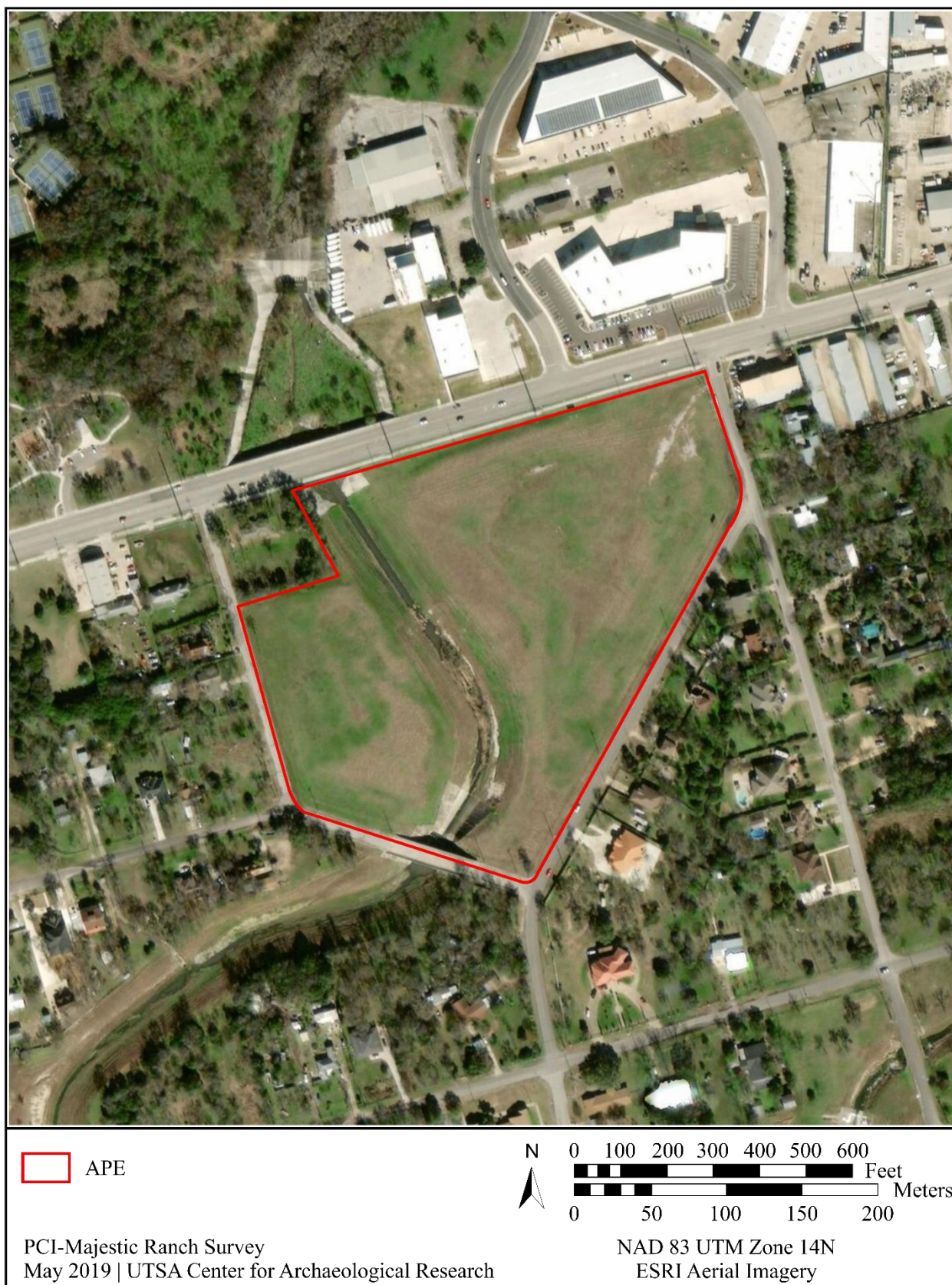
Figure 1-1. The APE on an aerial map.