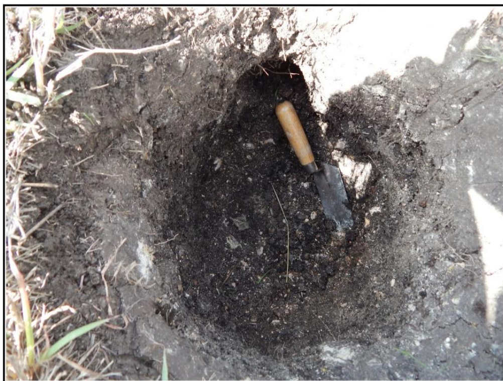
Figure 4-4. Shovel Test 5 (30 cmbs), note dark stains.