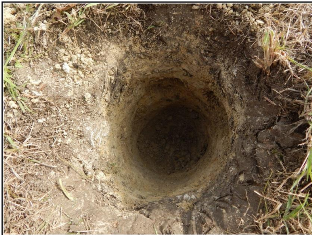
Figure 4-3. Shovel Test 2 (60 cmbs), note fill.