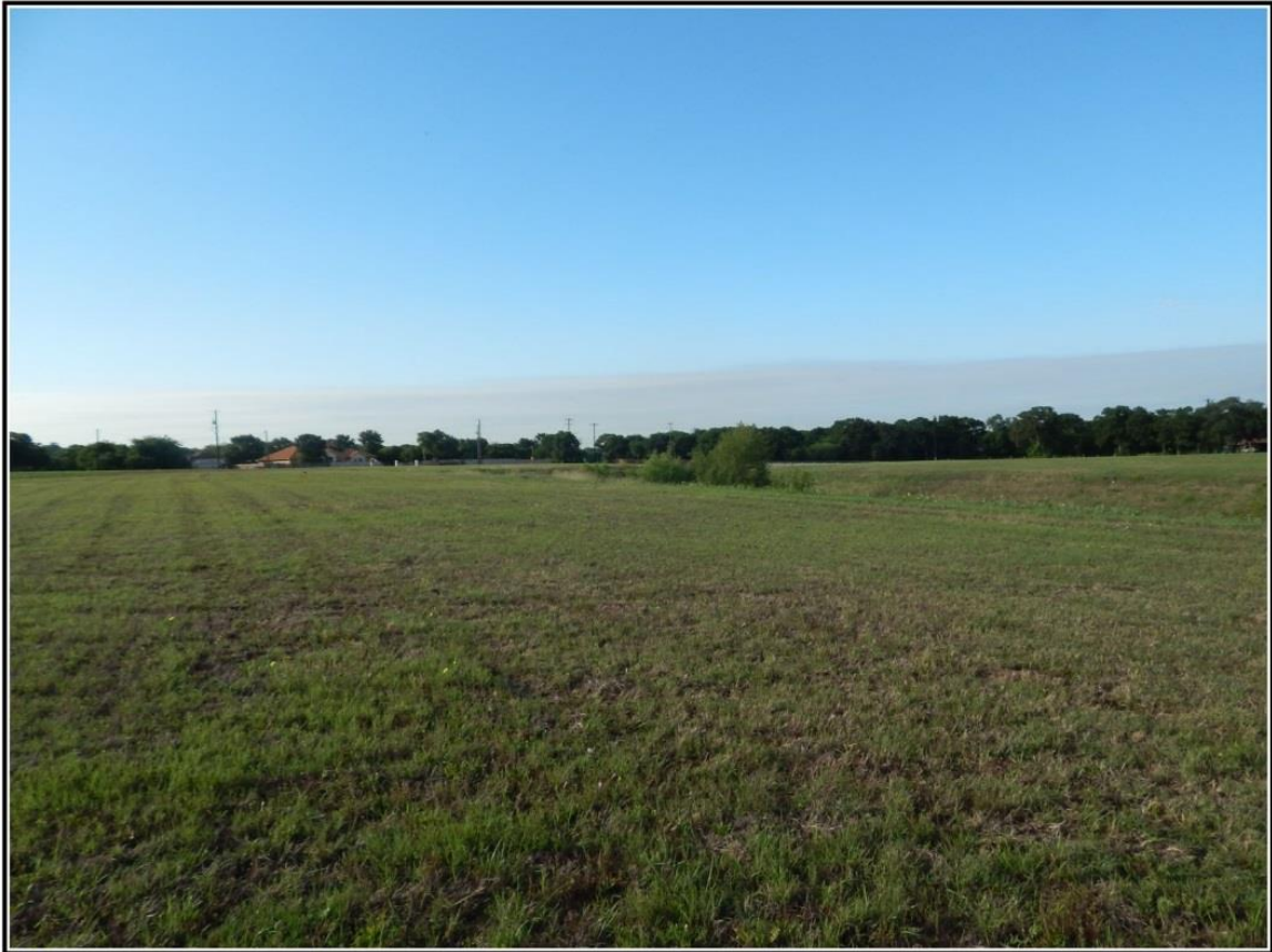
Figure 4-5. Central portion of the project area, note artificially raised appearance (facing south, Zarzamora Creek to the right).

Overall, the appearance of the landscape within the APE suggests significant modification. The landform within the project area as a whole appears to be artificially raised (Figure 4-5). The northern portion of the project area along Callaghan Road is paved (Figure 4-6). The creek within the project area is channelized (Figure 4-7).