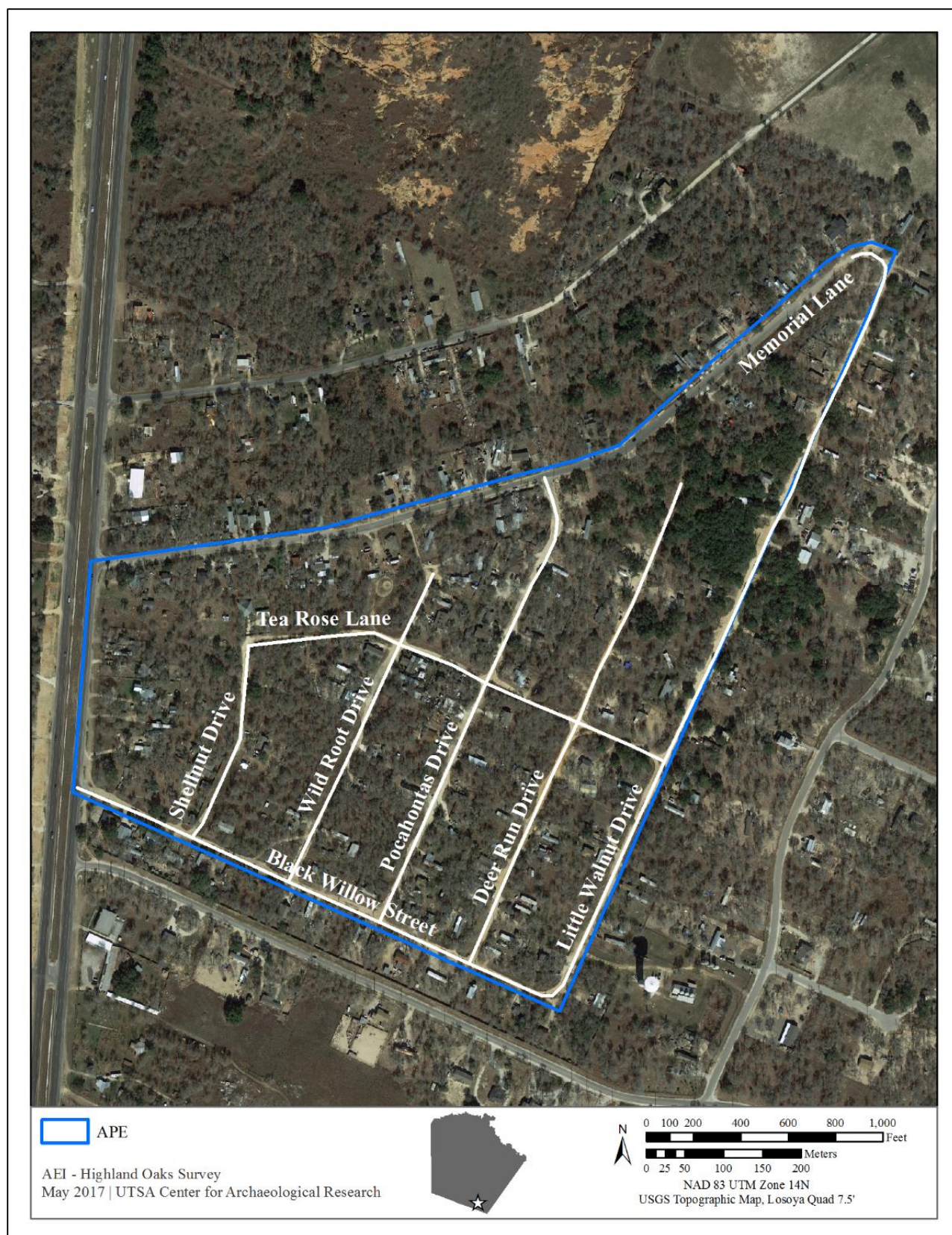
Figure 1-2. The APE depicted on an aerial map of the area (unimproved roads highlighted in white).