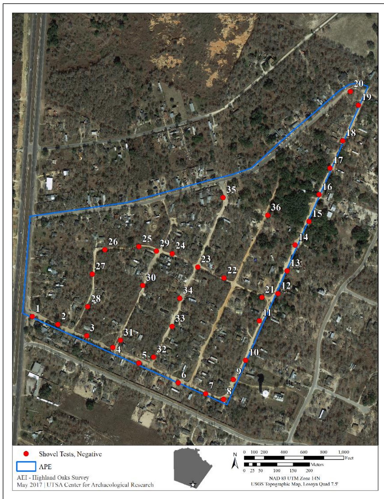
Figure 4-1. The APE with shovel tests in red.