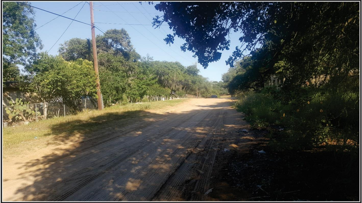
Figure 4-2. Photograph of the APE on Black Willow Street, looking west.