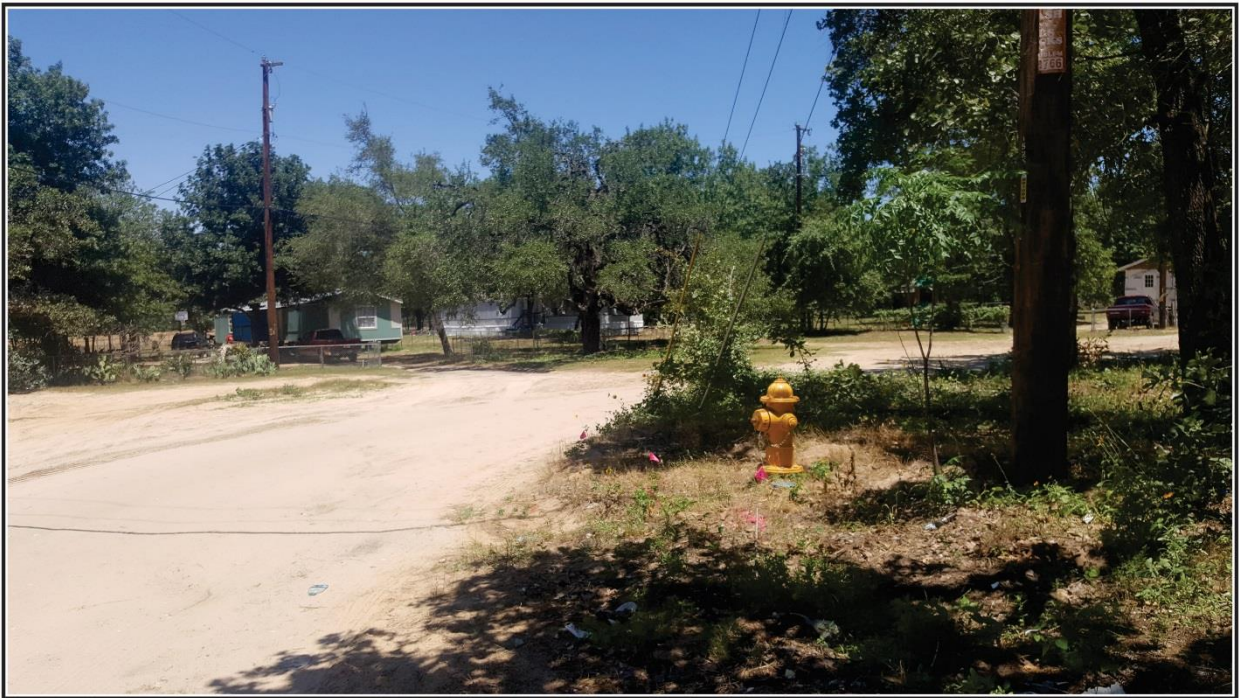
Figure 4-3. Photograph of the APE on Little Walnut Drive, looking north.