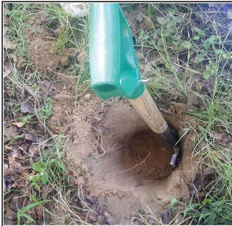
Figure 4-5. Sandy soils encountered during CAR shovel testing.