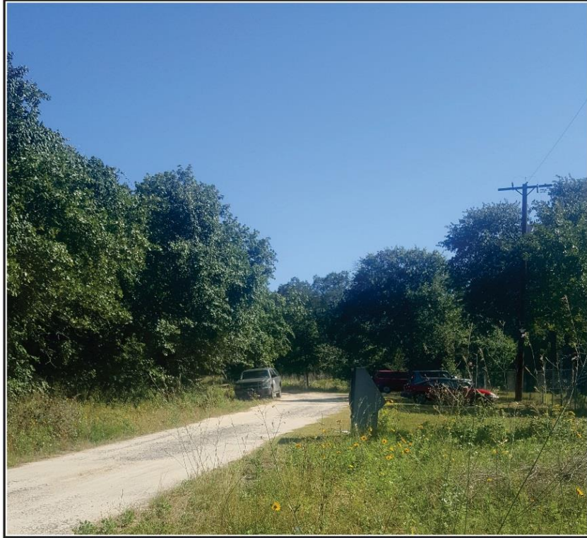
Figure 4-4. Photograph of the APE on Shellnut Drive, looking north.