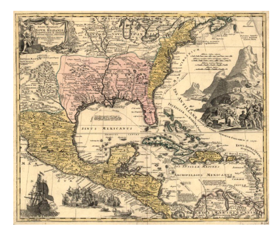
Figure 1. Nuevo España Map (Anville et al. 1979).

In following Catalina's descendants' journeys, it was evident that they were conquerors who proclaimed the "discovered" new world for Spain. From 1519–1685; 1690–1821, Spain ruled Nuevo España , which included Texas (see Figure 1: Nuevo España Map (Anville et al. 1979) & Figure 2: Van Humbolt (1811) Texas Map<sup>2</sup>; see Figure S2 van Humbolt Interactive Map). The French occupied the region from 1684–1690.