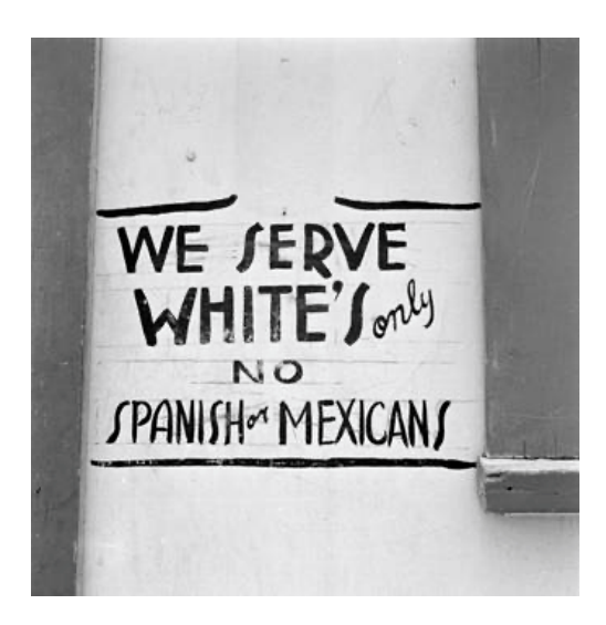
Figure 5. Segregation Signage (Lee n.d.).

citizenship rights. Beyond that, he had ancestral claims; Los Martínez at different points in time had resided in Texas.